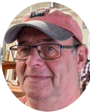
Section Manager (Metal)