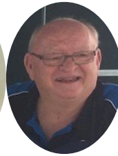
Health & Safety Manager