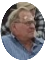
Grounds & Maintenance Officer