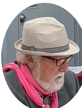
Social, Fundraising & Sponsorship Manager