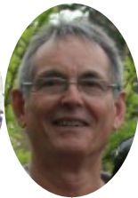
Communications & Media Manager