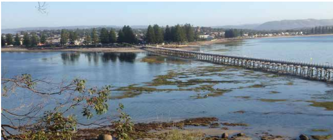
Causeway to Granite Island