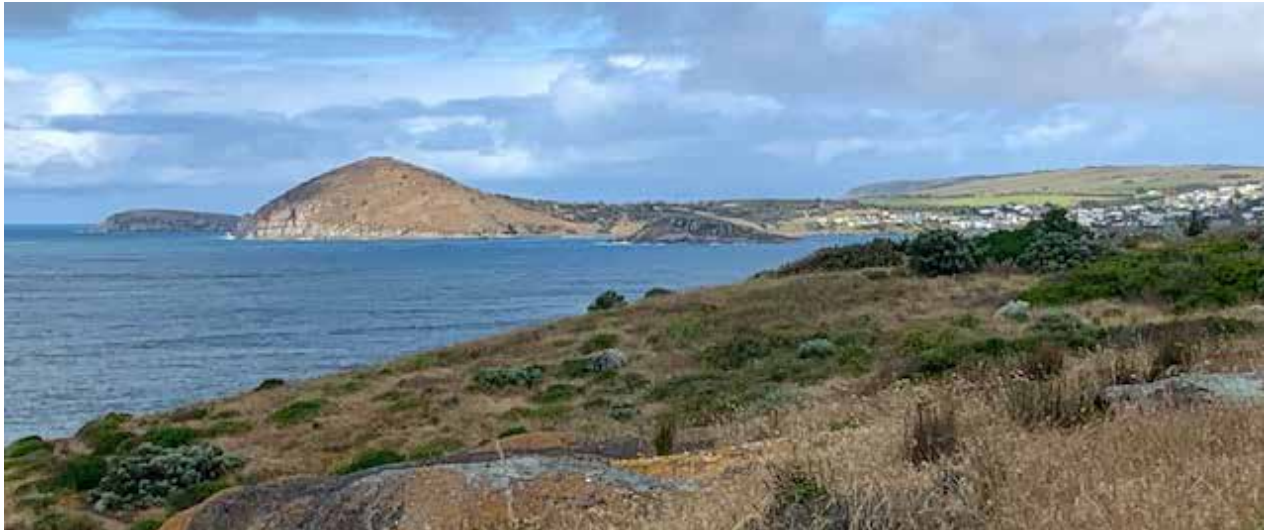
Looking to the Bluff from Granite Island