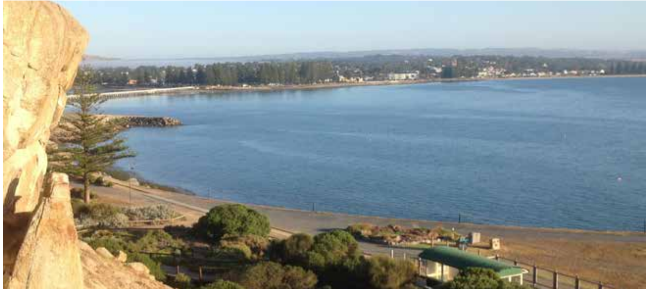
From the stairway on Granite Island