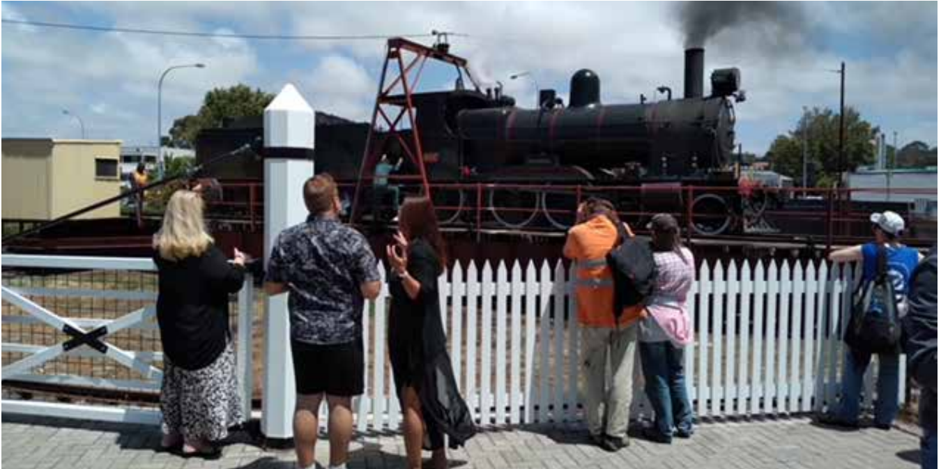
RX224 on turntable