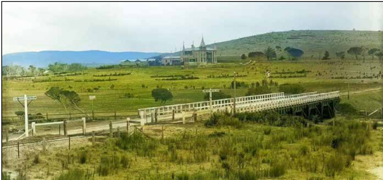
Early days of Adare