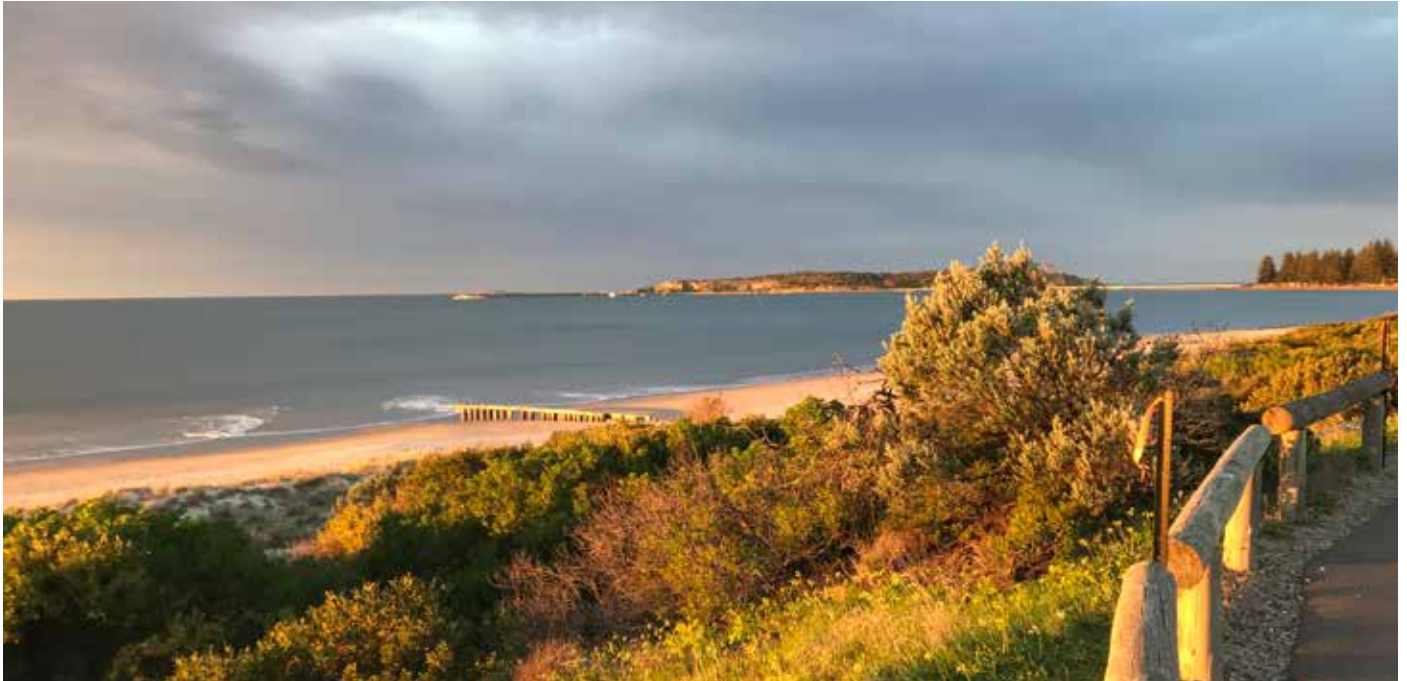
Sunrise, Victor Harbor