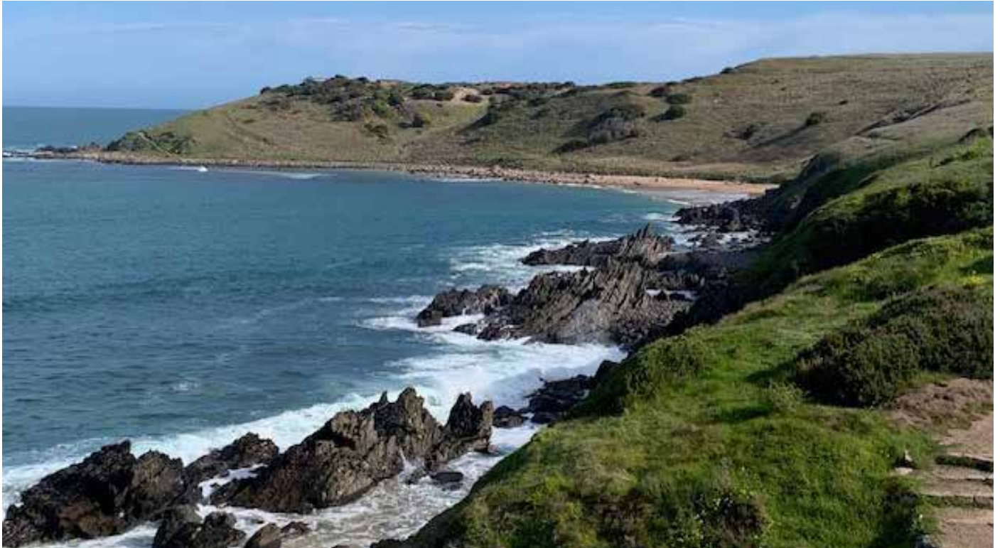
Kings Head and beach