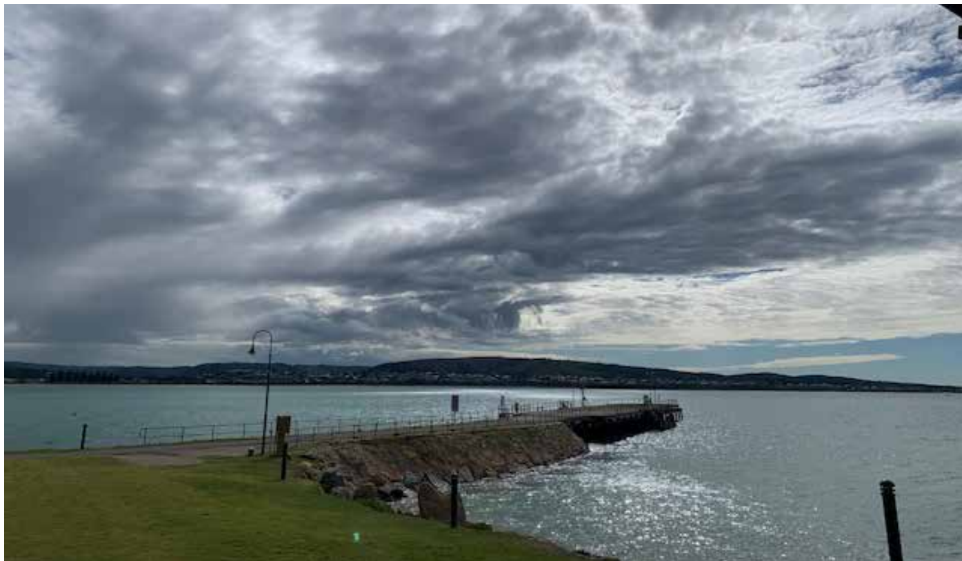
Weather change over Hayborough from Granite Island