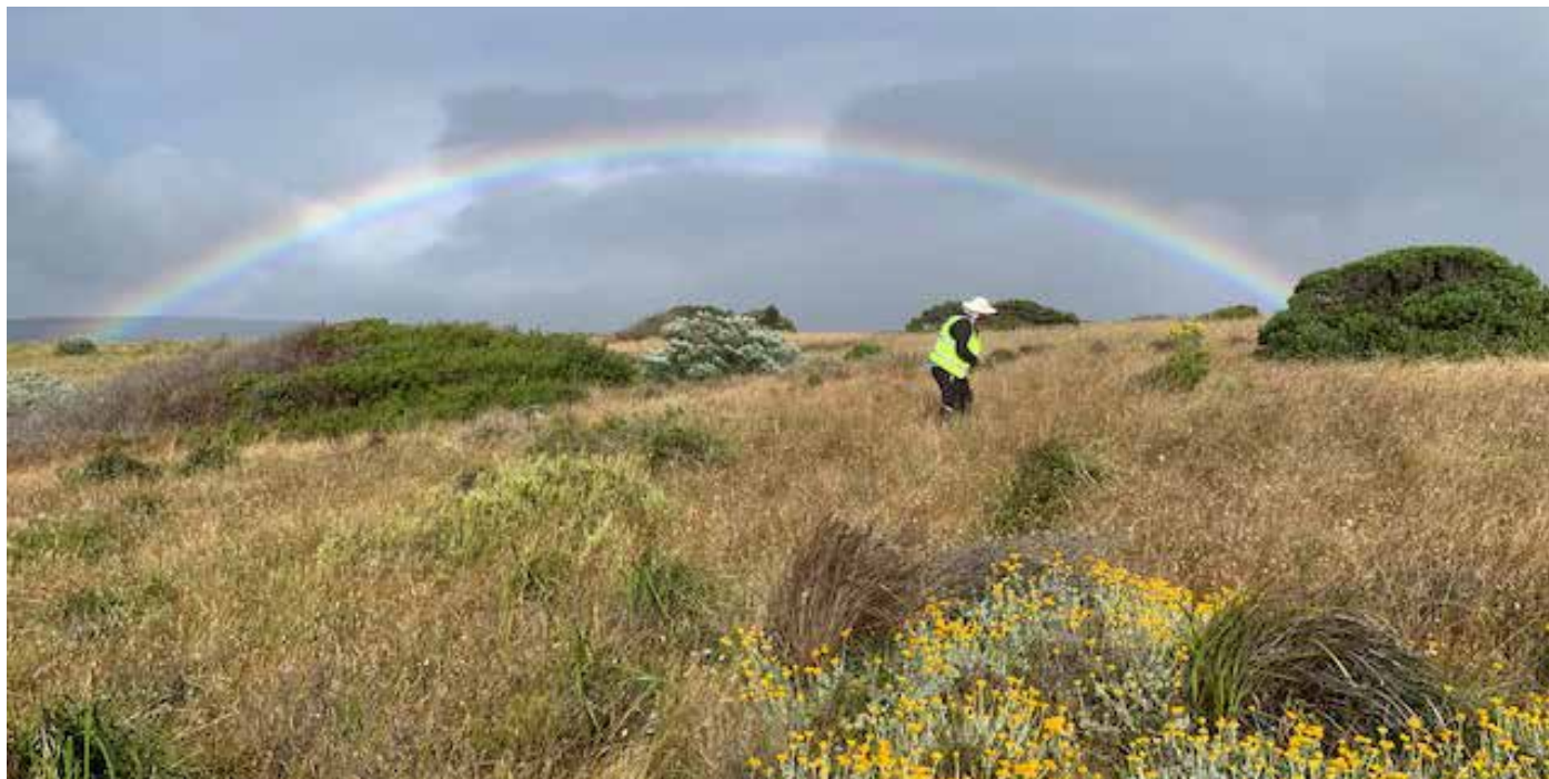
Granite Island south