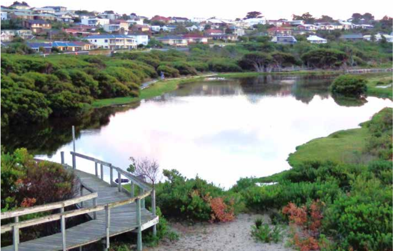
Sunrise in Victor Harbor