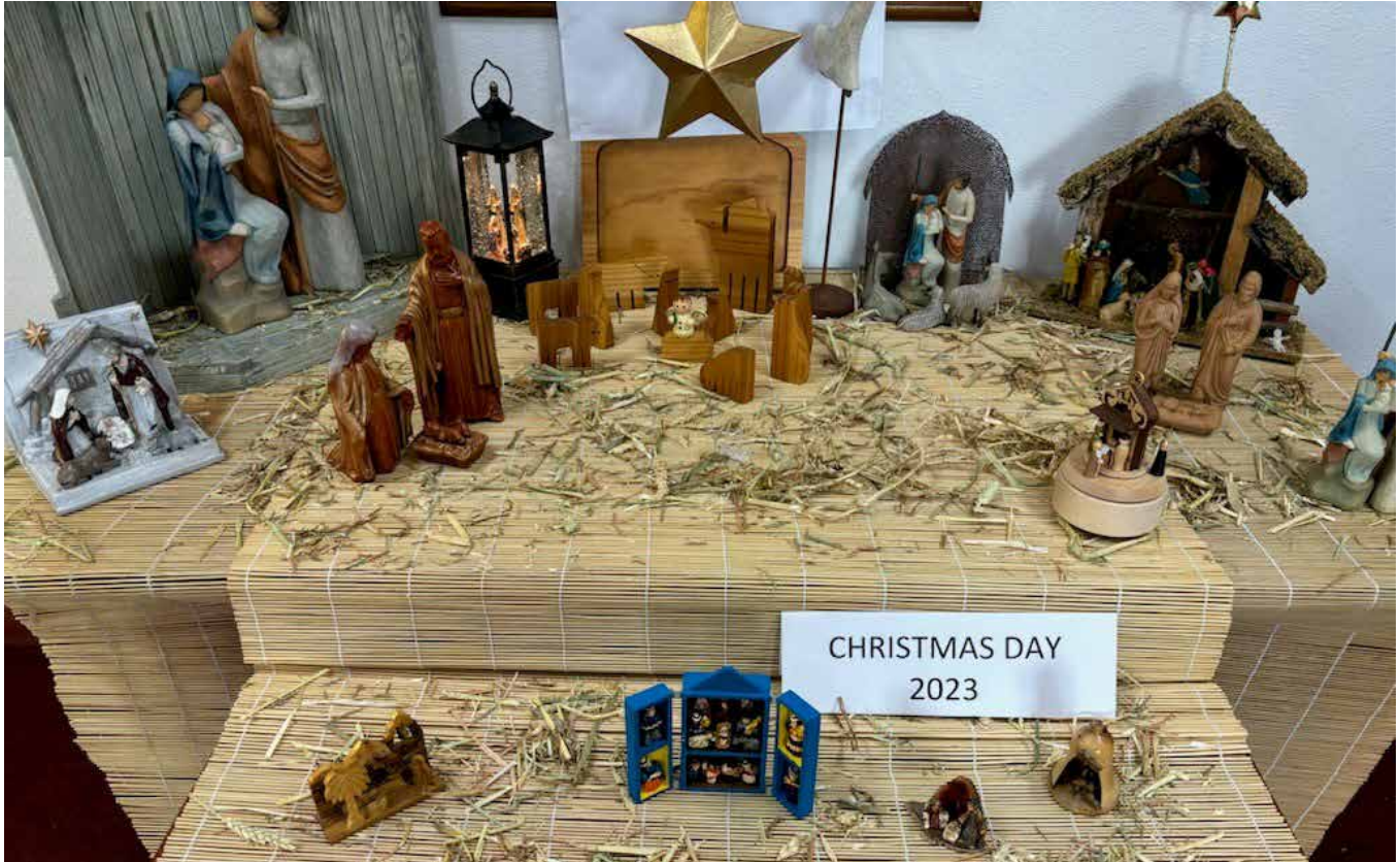
Nativity display 2023