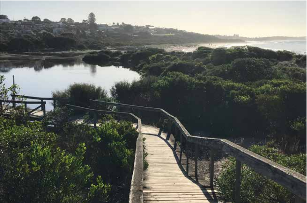
Bridge Tce to Hindmarsh estuary