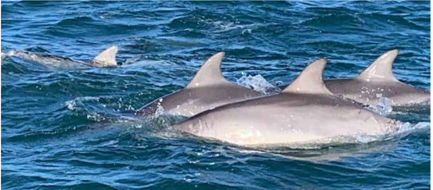
Bottle-nosed dolphins in Encounter Bay