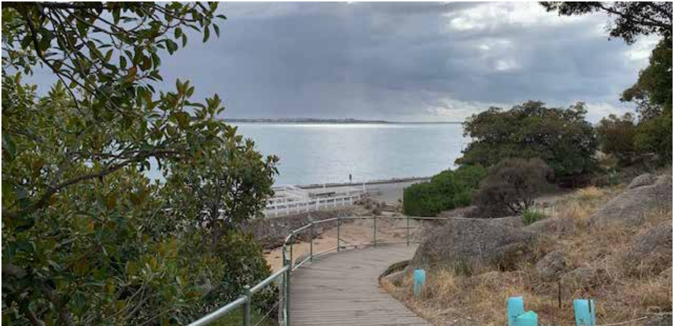
From Granite Island, looking north east