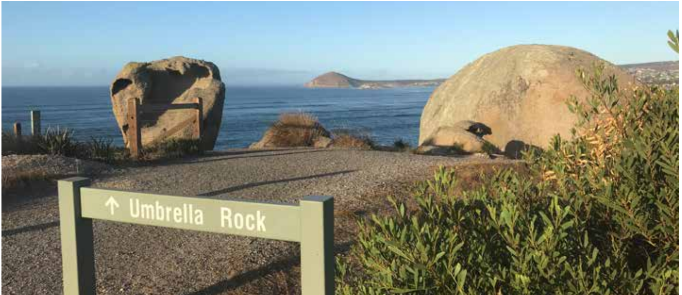
Umbrella Rock on Granite Island