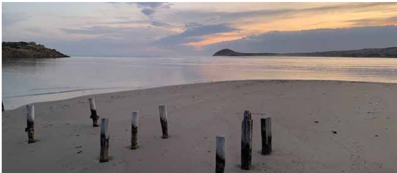
Early morning from causeway