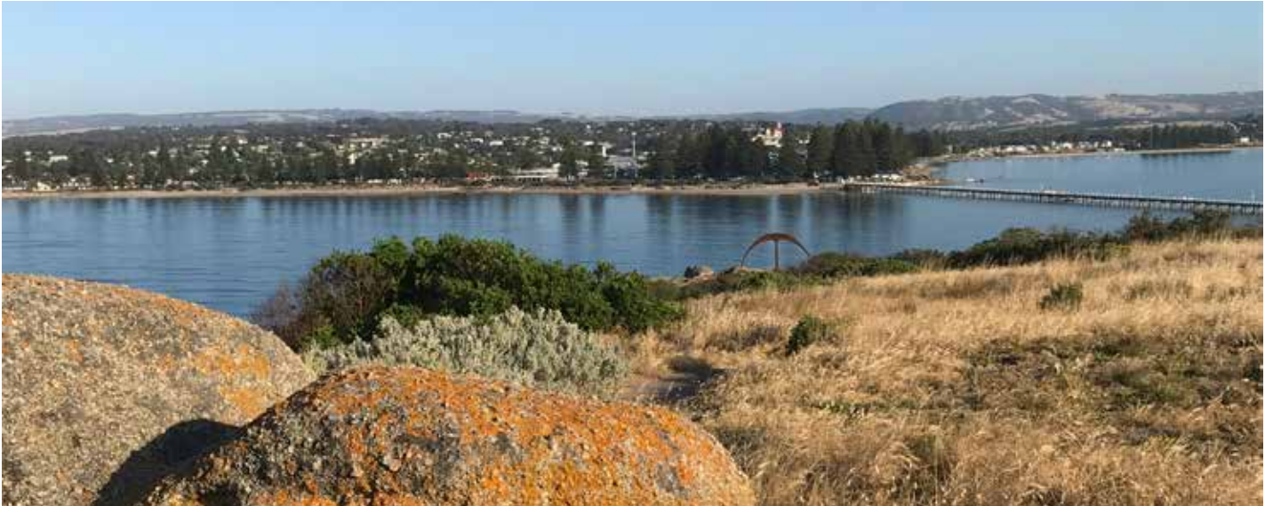
Victor Harbor from Granite Island