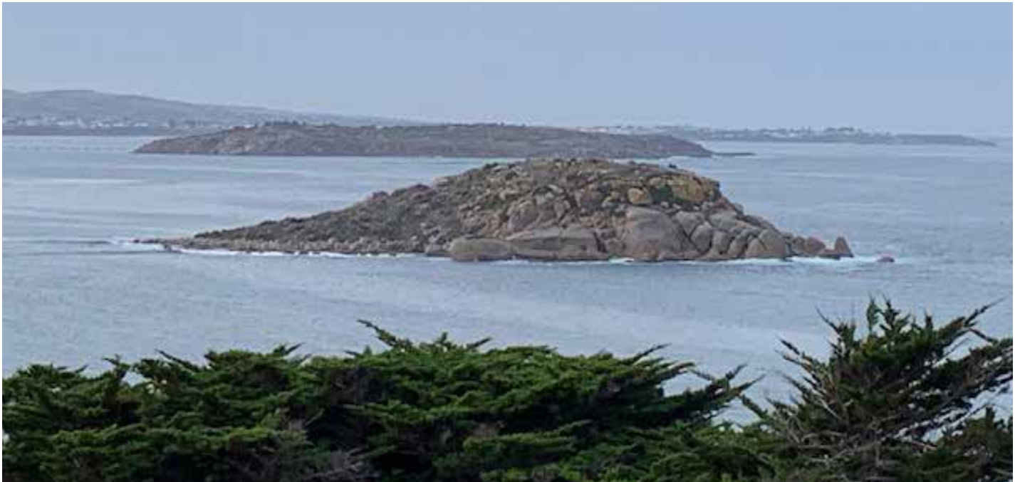
Wright and Granite Islands from The Bluff in dull afternoon light