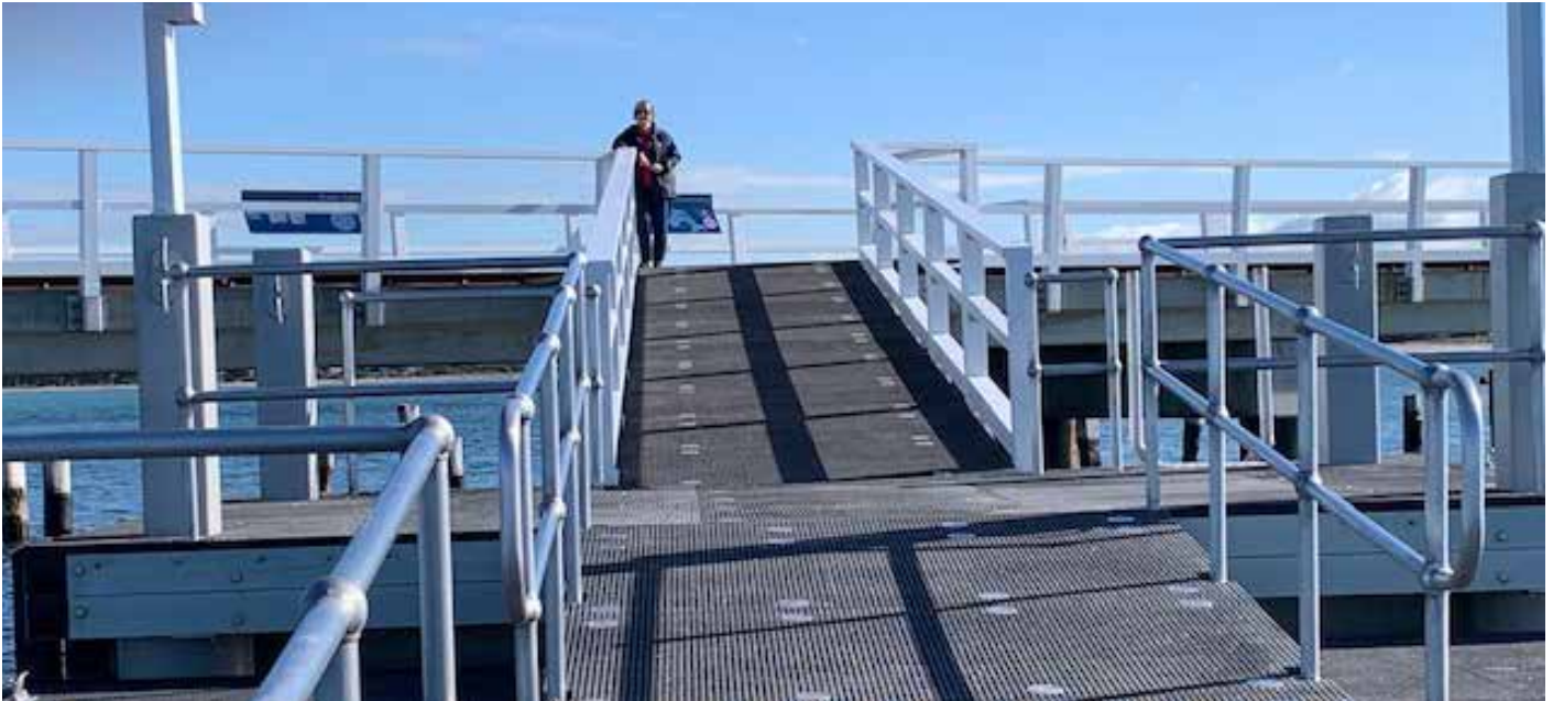
Boat-landing on new causeway