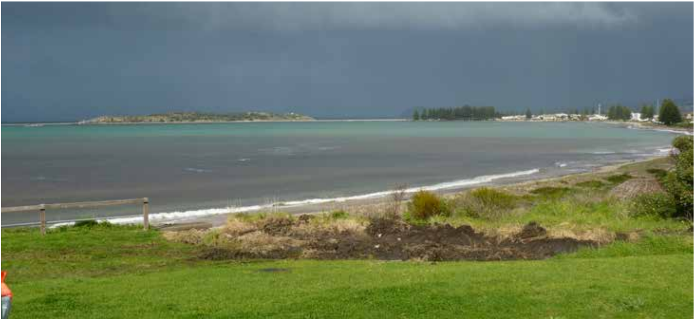
Victor Harbor - sea of many colours