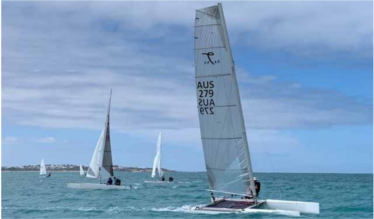
Sailing at Victor Harbor