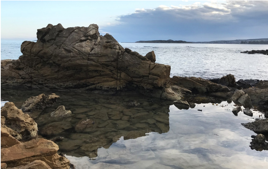
Chiton Rocks Reflection