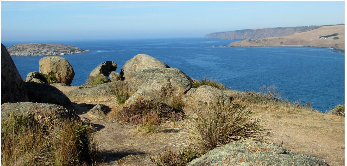
From the Bluff