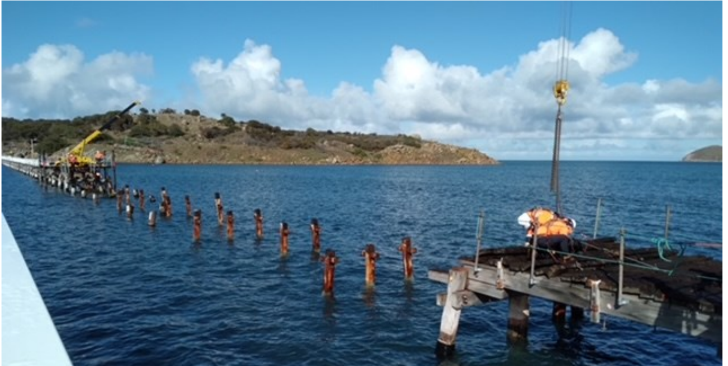
Old causeway demolition