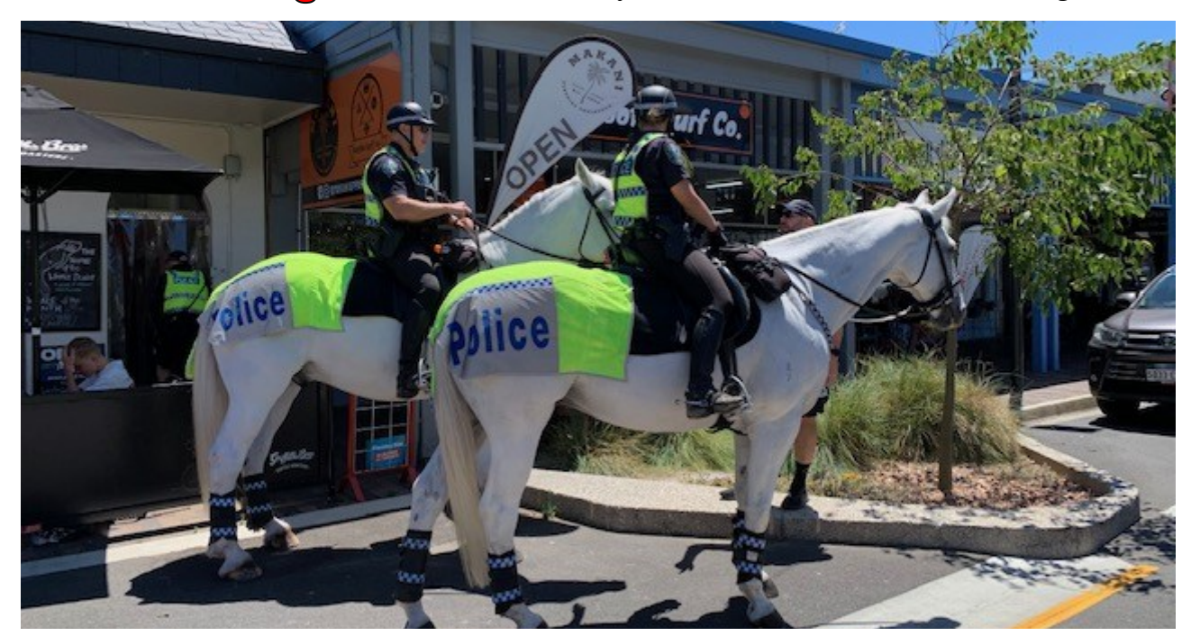
Police greys at the Tour Down Under