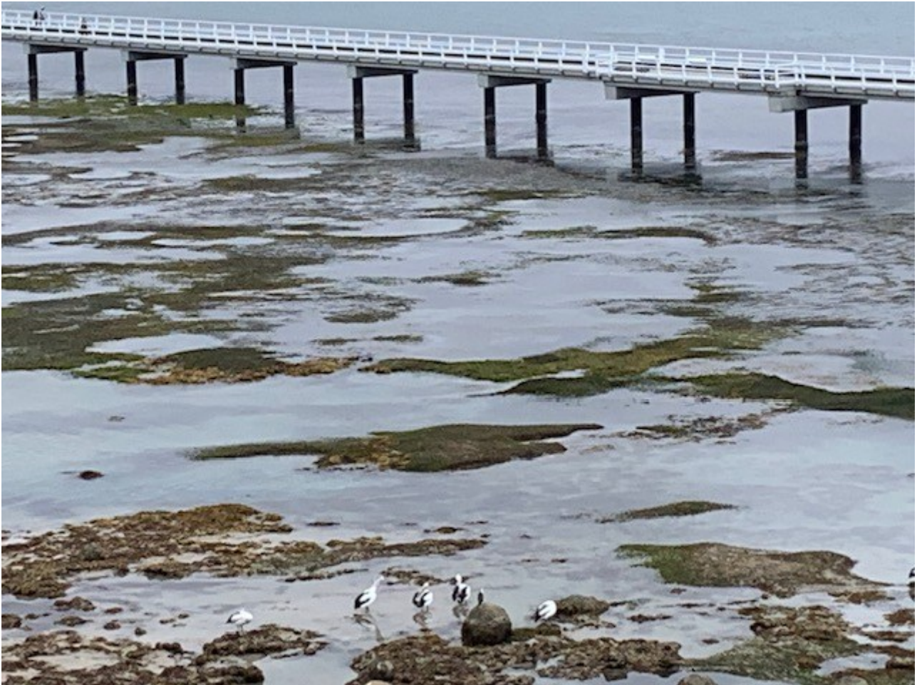
Low tide by the causeway