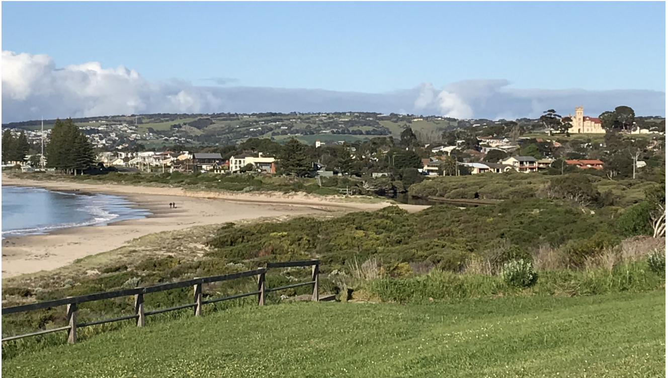
Another view of Victor Harbor