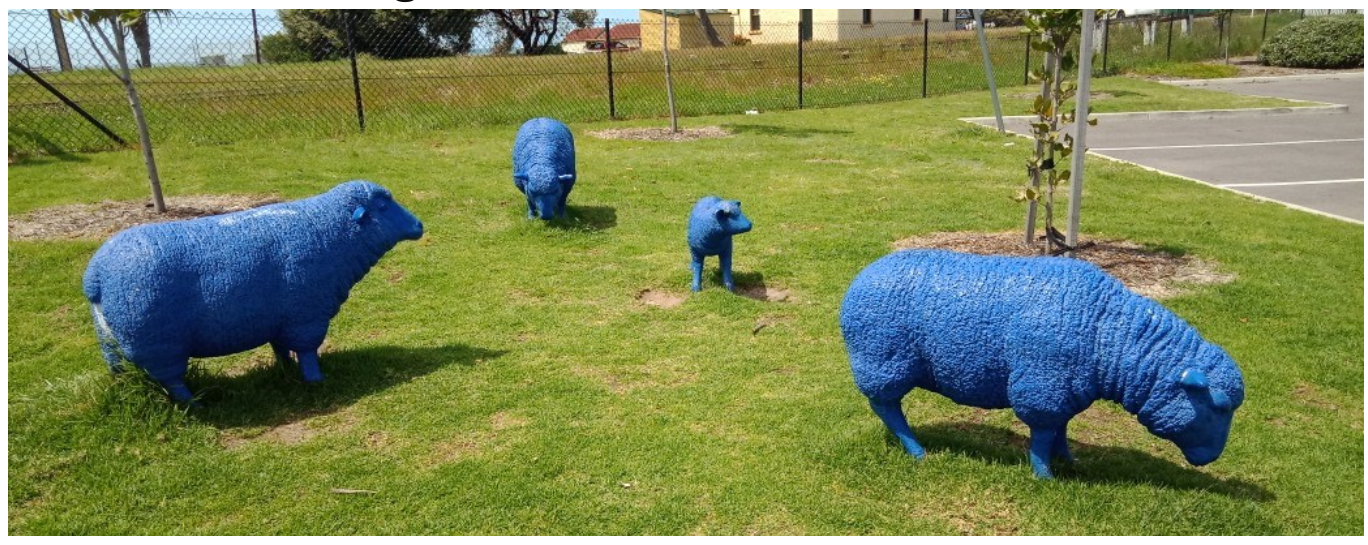
Sheep may safely graze!