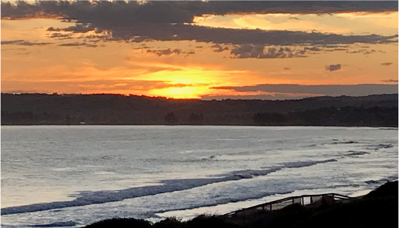
Sunset over Victor Harbor