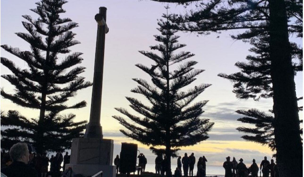
Anzac commemorations 2024