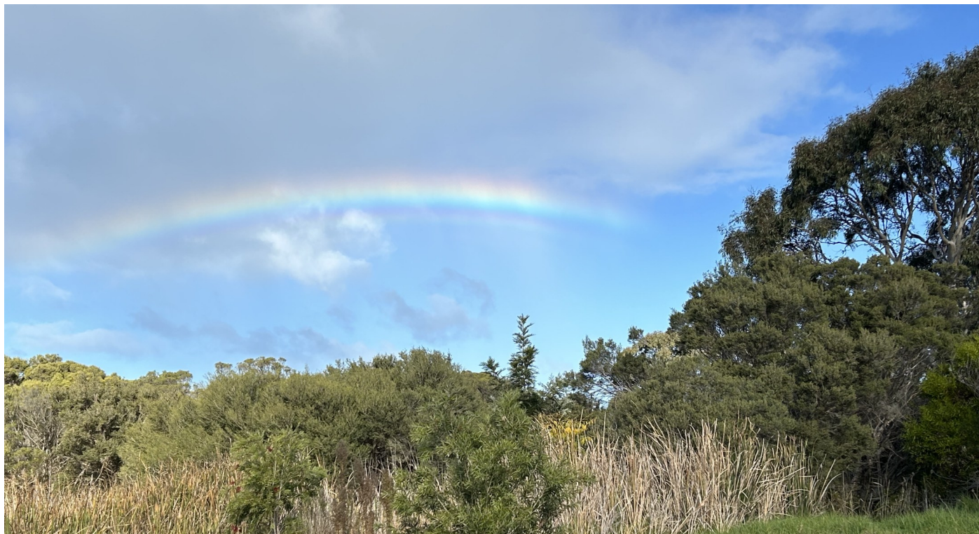
A bush rainbow