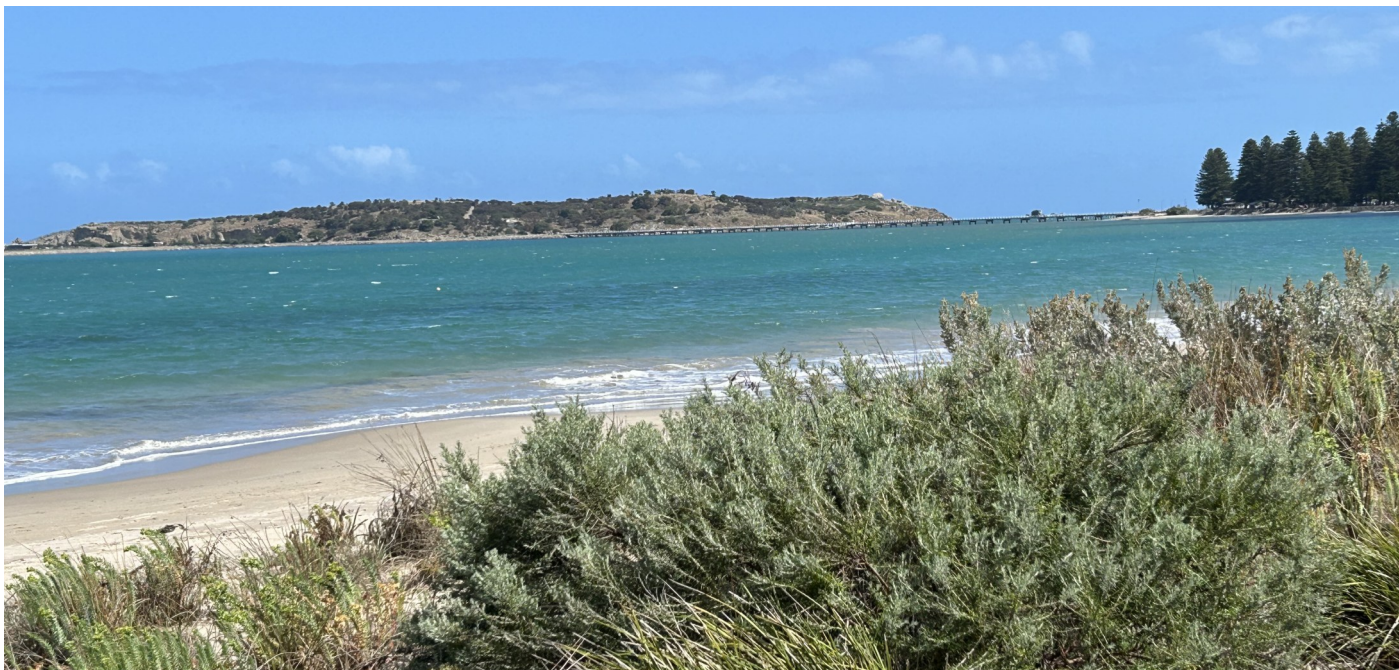
Beautiful Victor Harbor