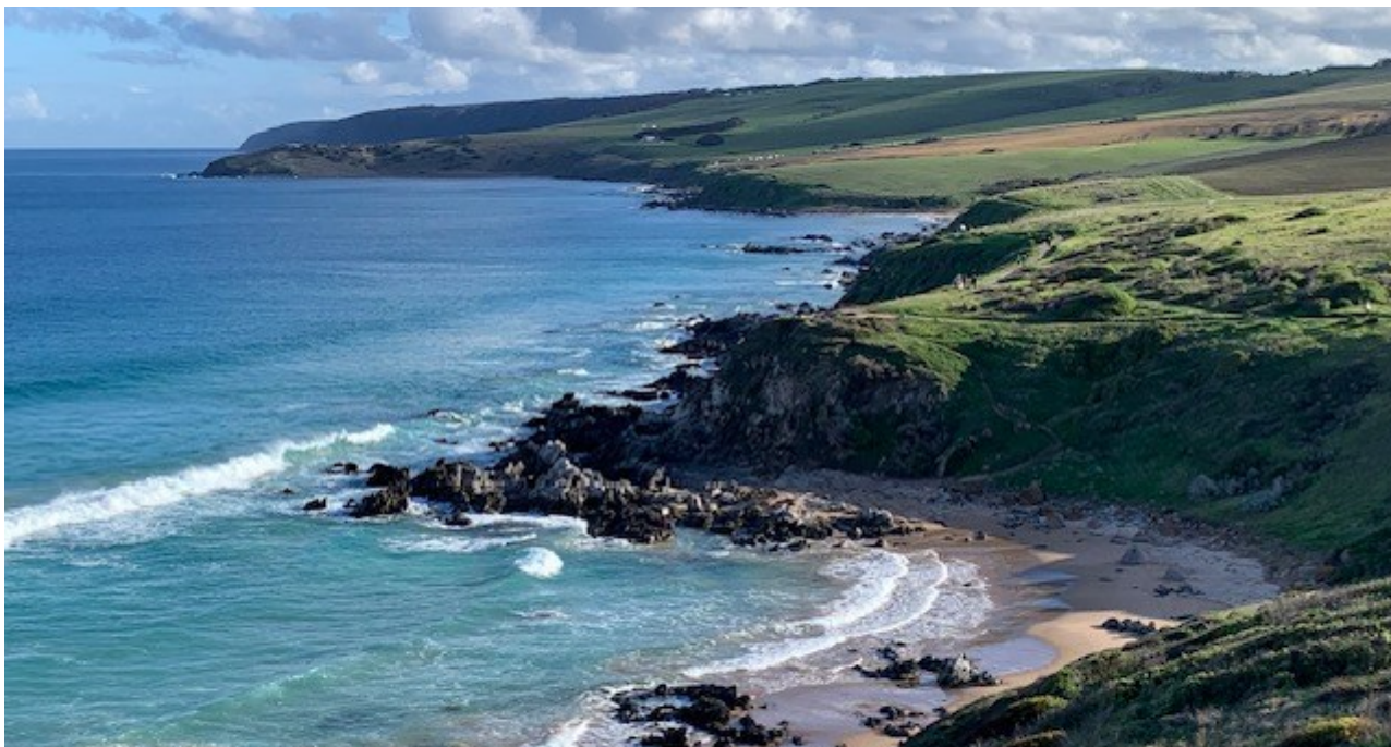
Petrel Cove, Kings Head and Waitpinga Cliffs from the Bluff