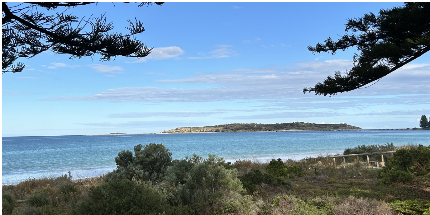
Granite Island from Bridge Terrace