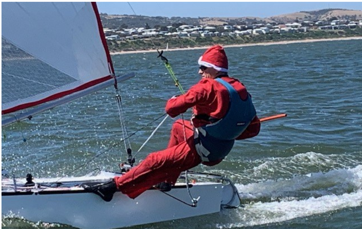
Santa comes to the Victor Harbor Yacht Club