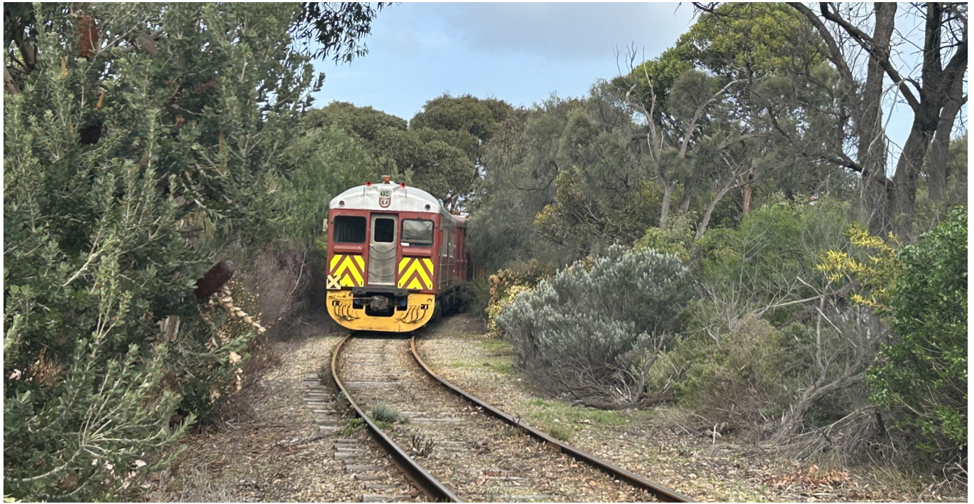
Cockle Train at Bridge Terrace