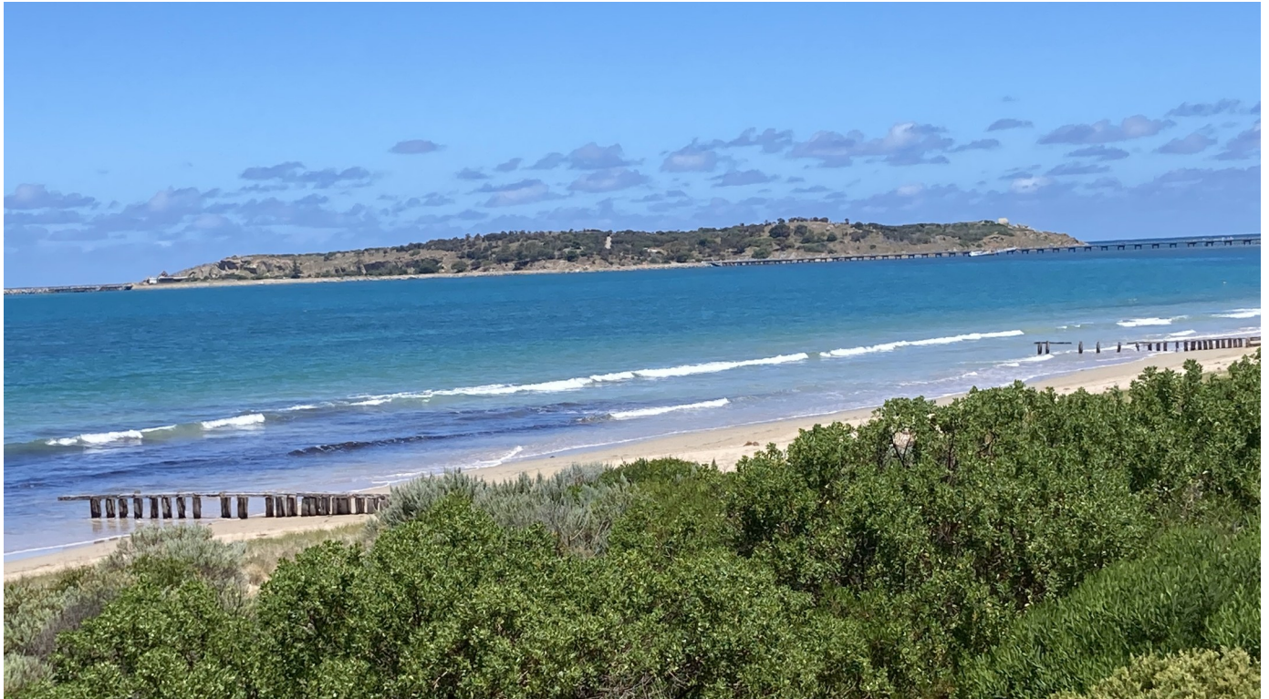
Beautiful Victor Harbor colours!